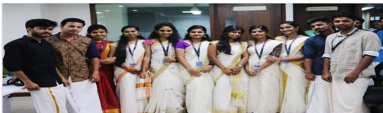
Students come in traditional dress on Ethnic Day